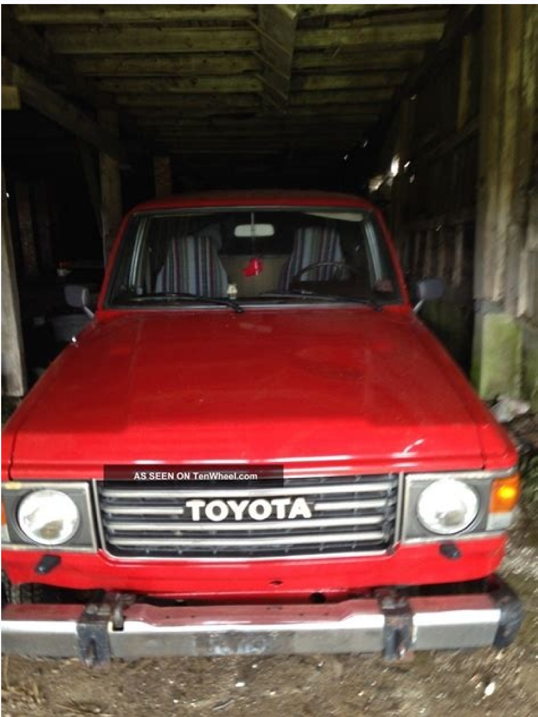
2013 land cruiser features. 2013 land cruiser oil capacity. 2013 toyota land cruiser owners manual pdf. 2013 land cruiser specs.